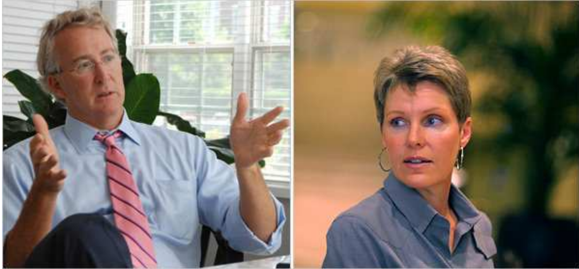
left